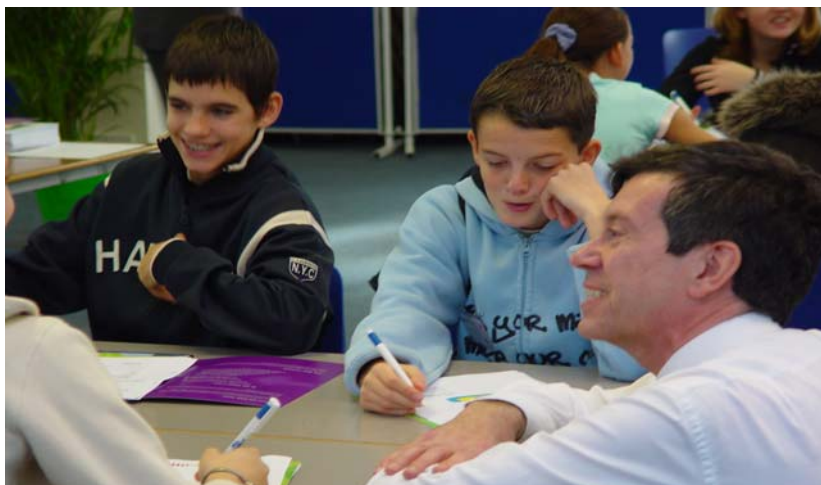
Local Pupils 'Aim higher' at a College Event

Clear progression pathways are identified across the three phases, secondary, tertiary and higher education. This has proved another successful programme helping young people to aim higher.