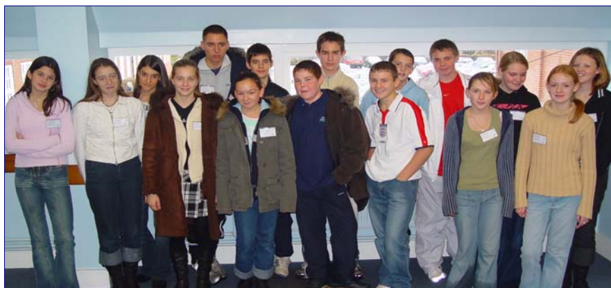
Local Pupils 'Aim higher' at a College Event

Thurrock schools currently participating are Aveley, Ockendon and the new Gateway Community